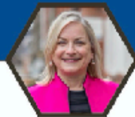
US Congresswoman Susan Wild