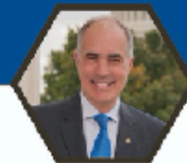
US Senator Bob Casey